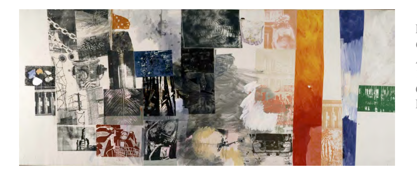
Robert Rauschenberg Colonnade (Salvage) , 1984 Acrylic and collage on canvas 113 1/4 x 274 x 2 inches (287.7 x 696 x 5.1 cm) Private collection

horizontal surface, a great big table. When the fabric that was to be used to make the costume was lifted off, there was this residue of ink that had gone through this very open costume fabric. Bob was not one to just waste something of that sort. That became the inspiration for what he called the Salvage series, because he salvaged this imagery and added to it. That became a body of paintings, and it was also a play on words because the edge of fabric is called a selvage, and Bob loved wordplay. So it was perfect.