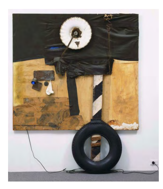
Robert Rauschenberg First Landing Jump , 1961 Combine: oil, cloth, metal, leather, electric fixture, and cable on composition board with automobile tire and wood plank 89 1/8 x 72 x 8 7/8 inches (226.4 x 182.9 x 22.5 cm) The Museum of Modern Art, New York Gift of Philip Johnson

White: No. I know Philip owned an early painting of the Combine period. He probably bought it from Castelli, I imagine. He was certainly interested in Bob's work, and one of the major early Combines at the Museum of Modern Art was purchased by Philip for the museum. I think it was at the request of Alfred [H.] Barr [Jr.], called First Landing Jump [1961]. So Philip was certainly sympathetic to the work.