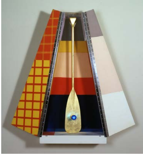
Robert Rauschenberg Publicon-Station I , 1978 Painted wood cabinet with fabric collage, Plexiglas mirror, polished aluminum, with gold-leafed paddle and electric lights 59 x 30 x 12 inches (149.9 x 76.2 x 30.5 cm) From an edition of 30 published by Gemini G.E.L., Los Angeles