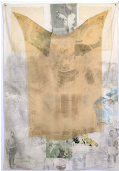
Robert Rauschenberg Pod (Hoarfrost) , 1975 Solvent transfer and collage on fabric 51 1/4 x 35 1/2 inches (130.2 x 90.2 cm) Private collection, New York