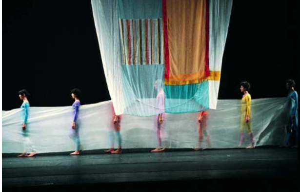
Costumes and set, entitled Tantric Geography (1977), designed by Rauschenberg for Merce Cunningham Dance Company's Travelogue (1977). Collection on Robert Rauschenberg Research.

Q: I believe you're right about the theater.