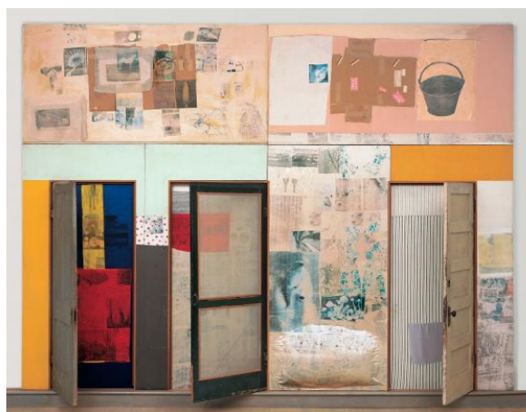
Robert Rauschenberg Rodeo Palace (Spread) , 1976 Solvent transfer, pencil, and ink on fabric and cardboard, with wood doors, fabric, metal, rope, and pillow, mounted on foam core and redwood 144 x 192 x 5 1/2 inches (365.8 x 487.7 x 14 cm) Collection of Lyn and Norman Lear, Los Angeles

together. So he sketched me out—unfortunately I probably don't have that sketch—he sketched me out the layout that he wanted for this: how many panels he wanted and where he wanted doors in them. He had some old doors, a screen door and some other old doors, either under the house or under the studio or someplace, and he showed me which of the doors he wanted to use. Then he asked me if I'd build the framework, put all this stuff on. That was the beginning of my probably four- or five-year involvement with what he was doing.