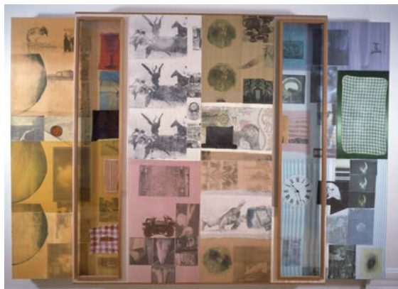
Robert Rauschenberg Earthstar Express (Spread) , 1979 Solvent transfer, fabric, acrylic, glass, brush, clock, crushed aluminum can, and reflector on fixed and movable wood panels 79 1/8 x 74 inches (201 x 188 cm) Robert Rauschenberg Foundation