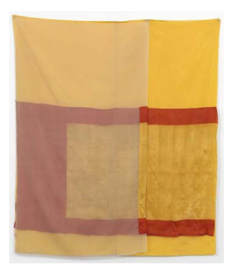
Robert Rauschenberg Mirage (Jammer) , 1975 Sewn fabric 80 x 69 inches (203.2 x 175.3 cm) Robert Rauschenberg Foundation