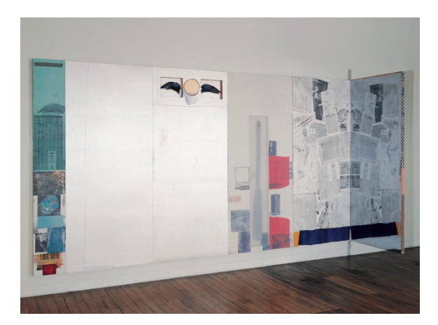
Robert Rauschenberg Opal Reunion (Spread) , 1976 Solvent transfer, acrylic, fabric, pencil, wood oar, and bird's wings on wood panels, with mirrored Plexiglas 84 x 194 x 36 inches (213.4 x 492.8 x 91.4 cm) Hunter Museum of Art, Chattanooga, Tennessee