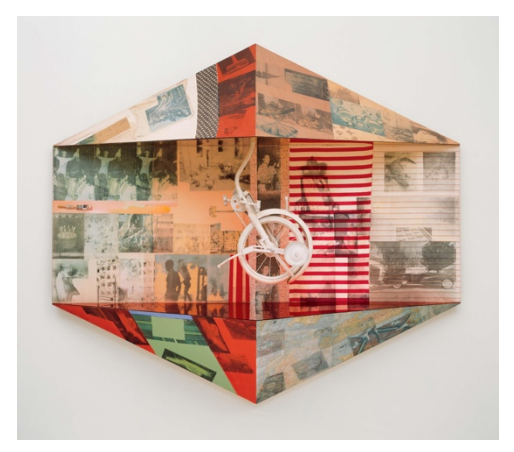
Robert Rauschenberg Miter I (Scale) , 1980 Solvent transfer, fabric and paper collage, acrylic, and mirrored panels with paintbrush and painted bicycle part on wood support 86 x 96 x 26 inches (218.4 x 243.8 x 66 cm) Robert Rauschenberg Foundation