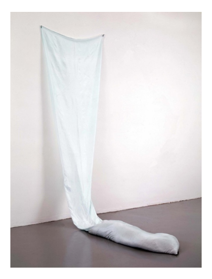
Robert Rauschenberg Skyfall (Jammer), 1976 Sewn fabric and sawdust 8 x 36 x 67 inches (223.5 x 91.4 x 170.2 cm) Private collection

Q: Yes, he was there for the Bones [1975] and Unions [1975]-