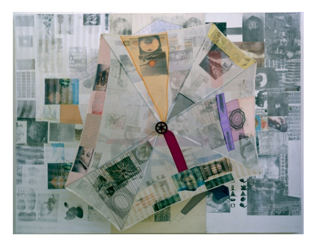
Robert Rauschenberg Musical Mollusk (Scale) , 1978 Solvent transfer on fabric on wood veneer with umbrella with solvent transfer, acrylic, pipe, and valve handle 84 3/4 x 110 x 32 inches (215.3 x 279.4 x 81.3 cm) Nassau County Museum of Art, New York

Q: For the Musical Mollusk and the Monarchal Mollusk [(Scale), 1978]-