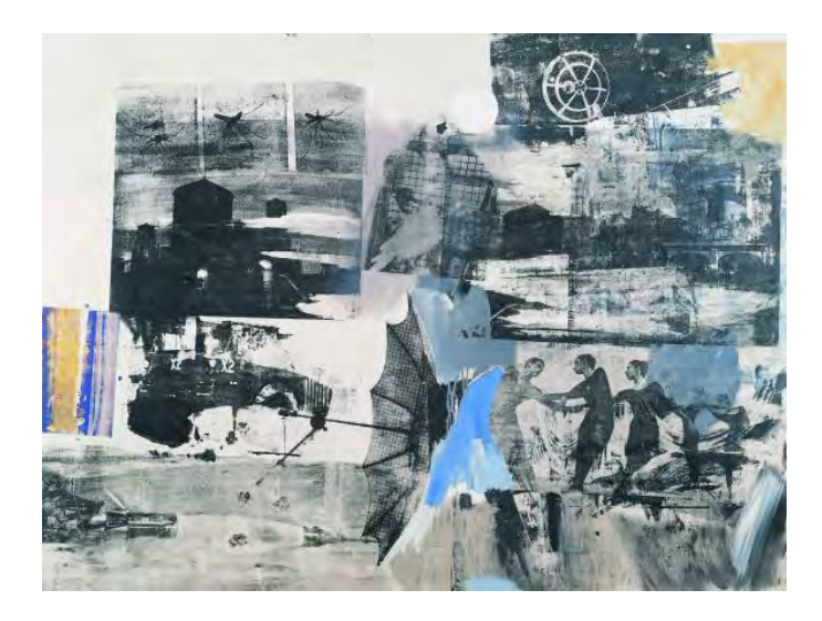
Robert Rauschenberg Scanning, 1963 Oil and silkscreen ink on canvas 55 3/4 x 73 inches (141.6 x 185.4 cm) San Francisco Museum of Modern Art Fractional and promised gift of Helen and Charles Schwab

Robert Rauschenberg Blue Eagle, 1961 Combine: oil, graphite, printed paper, cotton Tshirt, tin cans, and wire on canvas with electric cord and light bulb 84 x 60 x 5 inches (213.4 x 152.4 x 12.7 cm) depth variable Whitney Museum of American Art, New York Gift of The American Contemporary Art Foundation Inc., Leonard A. Lauder, President