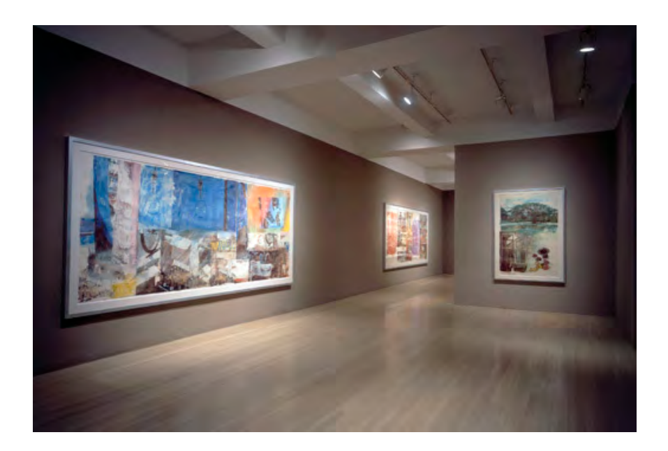
Installation view, Robert Rauschenberg: Anagrams , PaceWildenstein, New York, 1996.

works on paper. We sold out every single show. It built up a great momentum, and every show sold out. [Note: The exhibition Robert Rauschenberg: Anagrams was presented at PaceWildenstein, New York, 1996, and traveled to PaceWildenstein, Beverly Hills, 1996–97. The Whitney Museum acquired Fusion (Anagram) (1996); San Francisco Museum of Modern Art later acquired a work from the Anagram (A Pun) series (1997–2002).]