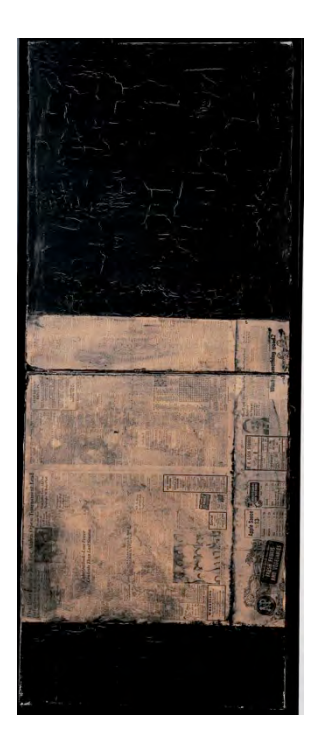
Robert Rauschenberg Untitled [matte black painting with Asheville Citizen], ca. 1952 Oil and newspaper on two separately stretched and joined canvases 72 1/4 x 28 1/2 inches (183.5 x 72.4 cm) The Museum of Modern Art, New York Purchase

Q: Yes. Asheville Citizen [Untitled (matte black painting with Asheville Citizen ), ca. 1952] was sold to MoMA here in '99.