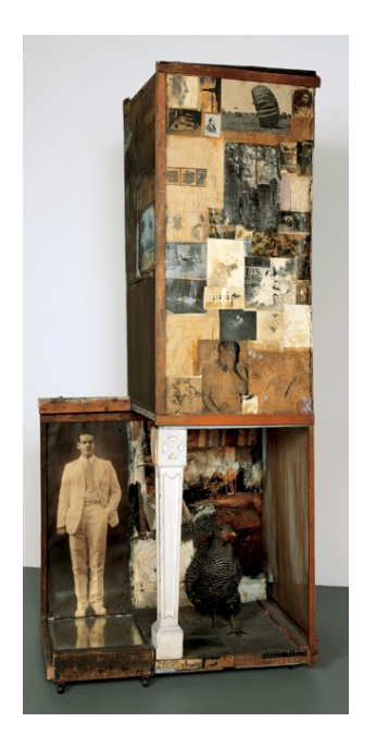
Robert Rauschenberg Untitled, ca. 1954 Combine: oil, pencil, crayon, paper, canvas, fabric, newspaper, photographs, wood, glass, mirror, tin, cork, and found painting with pair of painted leather shoes, dried grass, and Dominique hen on wood structure mounted on five casters 86 1/2 x 37 x 26 1/4 inches (219.7 x 94 x 66.7 cm) The Museum of Contemporary Art, Los Angeles The Panza Collection

Q: Did you buy it with him in mind or did you—