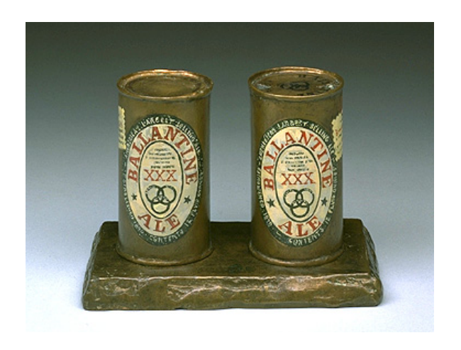
Jasper Johns Painted Bronze, 1960 Oil on bronze 5 1/2 x 8 x 4 3/4 inches (14 x 20.3 x 12 cm) Museum Ludwig, Cologne Ludwig Donation

So I called him immediately. Jasper said, "Where are you?" I said, "I'm at Leo's gallery," and he said, "Well come down. I'm on Houston Street." And I went down to Houston Street to his studio and he had just begun making—and he had several examples of—his sculpture; Light Bulb [1960], Flashlight [1960], Savarin coffee can with brushes [ Painted Bronze , 1960]. And as I went into the studio, I walked by a little [Kurt] Schwitters, which he had traded for after a time and I said, "Jasper, I've got a great idea," and he said, "What's your idea?" I said, "I'll show your sculpture in California along with Schwitters's collage," and he said, "I like that, but where will you get the Schwitters?" and I said, "An expatriate lady from Germany lives in Pasadena and she came with a bag full of Schwitters and I'm sure I can borrow them." He said, "Well, if you can borrow them, I'll send you my sculpture." And he did. We had that show in 1960 [ Jasper Johns–Kurt Schwitters ] and it was due to Castelli's generosity. He was always really generous and I adored him for it. He was very important to me and very important to my career in California.