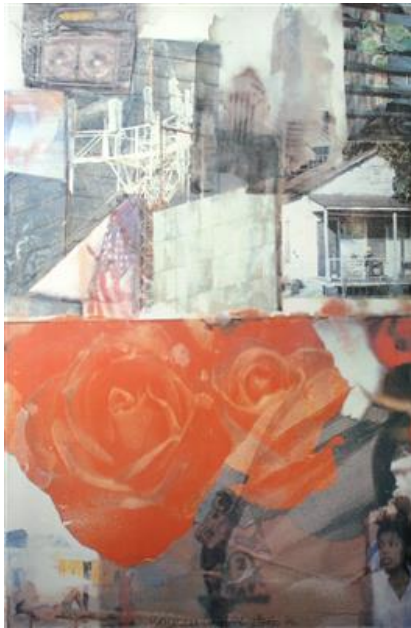
Robert Rauschenberg Domicile (Art in Embassies) , 1996 Lithograph 41 x 27 1/8 inches (104.1 x 68.9 cm) From an edition of 50, published by the Robert Rauschenberg Foundation, for the Friends of Art and Preservation in Embassies, Washington, D.C. Printed by Universal Limited Art Editions, West Islip RRF 96.E011