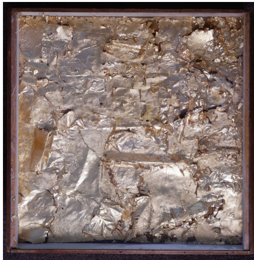
Robert Rauschenberg Untitled ( Gold Painting ), ca. 1953 Gold leaf and collage on fabric 16 3/4 x 16 1/2 x 3 3/4 inches (42.5 x 41.9 x 9.5 cm) Private collection RRF 53.025