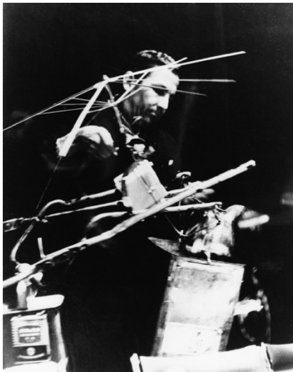
Rauschenberg assembling the Aeon “machine,” part of Rauschenberg’s set for Merce Cunningham Dance Company’s Aeon (1961), Japan, 1964. Photograph Collection.

Yes, Bob—you know that spontaneity, which led to improvisation, which collided with John, was always there and it was so wonderful to watch. It went back before this tour, when he made that—what we called the Aeon machine—for each performance, that thing that went across often with a blinking light on it that looked very threatening. And because he was a lighting designer also, he would darken the stage as this creepy thing went along the upstage area. It was just—I wish I could draw. I would draw a picture of a man whose capacity for making things with art—stuff was just coming out of all ten fingers all the time.