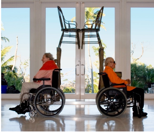
Rauschenberg and Merce Cunningham with Rauschenberg's The Ancient Incident (Kabal American Zephyr) (1981), Captiva Drive studio, Captiva, Florida, 2007.