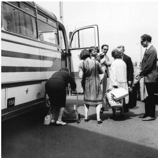
Rauschenberg, Merce Cunningham and others boarding tour bus during Merce Cunningham Dance Company's six-month world tour, 1964.

So we left like that. That was nuts. I was already terrified of the financial situation and now we have all this stuff that we're going to have with us. Thank god the bus that I'd gotten—charter bus on the other end, a big Mercedes bus, far bigger than you needed for eighteen people, but not far bigger if you're carrying—