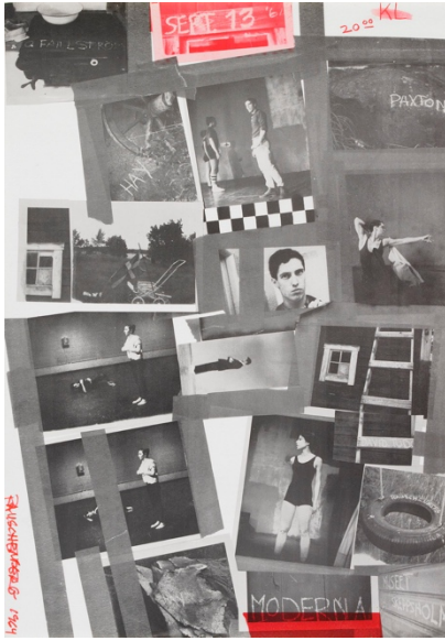
Robert Rauschenberg Untitled (Poster for Rauschenberg Theater Pieces for Five New York Evenings, Moderna Museet, Stockholm), 1964 Offset lithograph 17 1/4 x 12 3/8 inches (43.8 x 31.4 cm)

Q: No. I'm trying to remember—I don't have a visual memory now, but possibly—