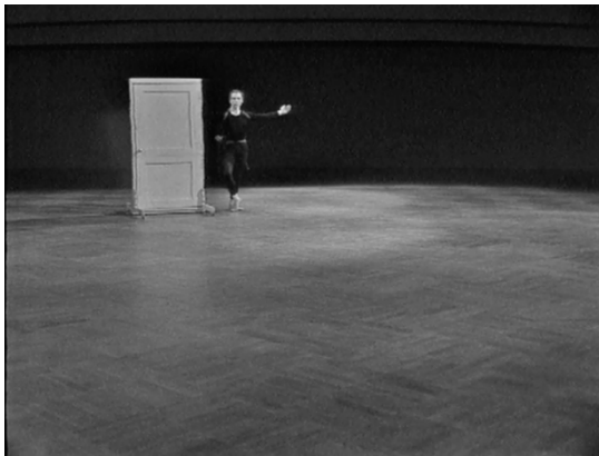
Merce Cunningham performing Antic Meet (1958) in 1964. Still from television production. 16mm, black-and-white film with sound, 27 min., 9 sec. Set and costumes by Rauschenberg.