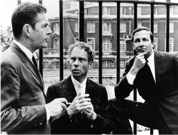
John Cage, Merce Cunningham, and Robert Rauschenberg at Sadler's Wells Theatre, London, during Merce Cunningham Dance Company 1964 world tour, July 1964.