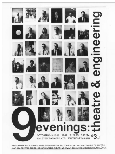
Robert Rauschenberg Poster for 9 Evenings: Theatre & Engineering, 1966 Offset lithograph 36 1/2 x 24 1/4 inches (92.7 x 61.6 cm) From an edition of 90