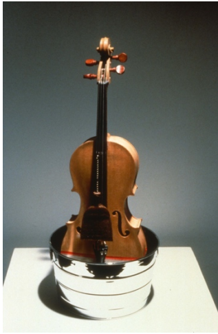
Robert Rauschenberg Tibetan Garden Song / ROCI TIBET , 1986 Cello, chrome-plated wash tub, glycerin, Chinese scrollmaker's brush, mirrored Plexiglas 43 x 18 1/4 inches (109.2 x 46.4 cm) diameter From an edition of 25, produced by Graphicstudio, University of South Florida, Tampa; only 20 realized