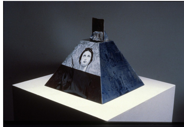
Robert Rauschenberg Araucan Mastaba / ROCI CHILE , 1986 Hand painting and silkscreen ink on mirrored aluminum with cast sterling silver and lapis lazuli 20 5/8 x 22 x 22 inches (52.4 x 55.9 x 55.9 cm) From an edition of 25, produced by Graphicstudio, University of South Florida, Tampa; only 12 realized