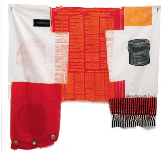
Robert Rauschenberg Cat Paws (Airport Suite) , 1974 Color relief and intaglio on fabric with bottle caps and buttons 34 x 35 1/2 inches (86.4 x 90.2 cm) From an edition of 20, published by Graphicstudio, University of South Florida, Tampa