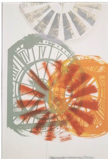
Robert Rauschenberg Sterling/Whirl , 1993 Acrylic screen print, acrylic hand painting, fire wax and silver pigment dust on paper with acrylic screenprint on Lexan in aluminum frame 63 1/2 x 44 inches (161.3 x 111.8 cm) From an edition of 17 published by Saff Tech Arts, Oxford, Maryland

Holzer: They were prints on paper, and screenprinted. They had, again, acrylic, and they also had encaustic—so there was some encaustic. That’s sort of like my photograph of the windmill blades, and then Bob had a photograph here of the clock, which might have been an old screen back from the ROCI stuff I made. Like I said, we made all these screens. [Note: Referring to the print Sterling/Whirl , 1993. Rauschenberg made two other prints at this time with Saff Tech Arts: Cock-Sure , which included a windmill image, and Prime Pump , both 1993.]