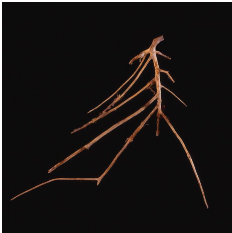
George Holzer Dashing Stick , 2008 Photograph 20 x 20 inches (50.8 x 50.8 cm)

As far as my artwork itself, it’s hard to say. It’s pretty hard to step back and really look at your own stuff very effectively. For instance some of my more recent work, some series of works, were singular images of leaves or of seeds or of sticks, things that are dead, things that are not pretty but I find interesting-looking. And I photograph them on just a flat black background. So some people find them pretty depressing because they’re so dark.