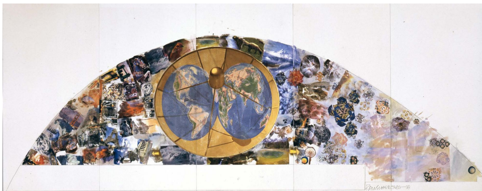
Robert Rauschenberg The Happy Apocalypse [original artwork for Padre Pio Liturgical Hall], 1999 Inkjet pigment transfer, acrylic, and graphite on poly laminate 96 x 250 1/16 x 2 inches (243.8 x 635.2 x 5.1 cm) The Menil Collection, Houston Gift of the artist in memory of Walter Hopps