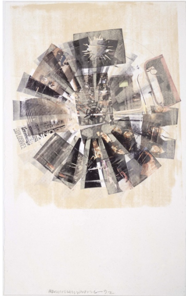
Robert Rauschenberg Windward Series IX , 1992 Acrylic, solvent transfer, and graphite on paper 60 x 37 3/4 inches (152.4 x 95.9 cm) Robert Rauschenberg Foundation

catalogues pretty much—not all of Rauschenberg’s, but just the things that relate to Saff Tech Arts and Graphicstudio.