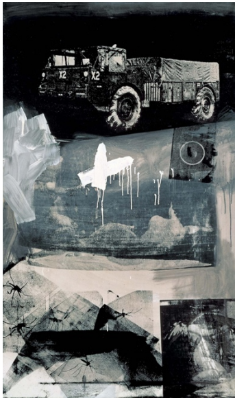
Robert Rauschenberg Crocus , 1962 Oil and silkscreen ink on canvas 60 x 36 inches (152.4 x 91.4 cm) Collection of Linda and Harry Macklowe, New York

Q: So we're looking at Crocus [1962, a silkscreen painting]—