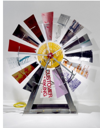
Robert Rauschenberg Eco-Echo VI , 1992–93 Acrylic and silkscreened acrylic on aluminum and Lexan with sonar-activated motor 88 x 73 x 26 inches (223.5 x 185.4 x 66 cm) Made in collaboration with Saff Tech Arts, Oxford, Maryland Private collection

Q: According to this Art in Collaboration book [ Donald Saff: Art in Collaboration , 2010]—