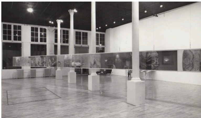
Installation view, Rauschenberg on Greene Street: Kabal American Zephyr, Japanese Clay Works, Japanese Recreational Clayworks, 7 Characters, Chinese Summerhall , Leo Castelli, New York, 1982–83. Work shown: Chinese Summerhall (1982; partial).