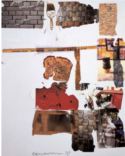
Robert Rauschenberg Toss + Measure (Shales) , 1994 Fire wax and transfer on canvas 60 x 48 x 1 1/2 inches (152.4 x 121.9 x 3.8 cm) Made in collaboration with Saff Tech Arts, Oxford, Maryland Private collection

Q: Yes, Shales , where the encaustic actually—