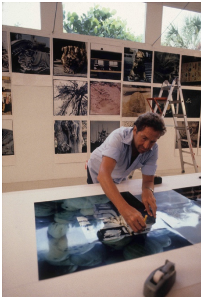
Rauschenberg working on the original collage for Chinese Summerhall (1982), Laika Lane studio, Captiva, Florida, 1982.

I did get to meet Bob before we did make the one hundred-foot. I needed to look at these test sections that we had done and ask him what he wanted me to do with them. And it was easier for me to go down there for it than for him to come up to us, which I'm not sure why that would be, but it was. So I drove down there and we went through it. And there's a picture of me with Bob there looking at—we were looking at different sections sort of proofing, "Do you want to have this overlap or do you want to have—these are the colors and this is how they mix," just making small adjustments on it and getting his blessing and approval for it.