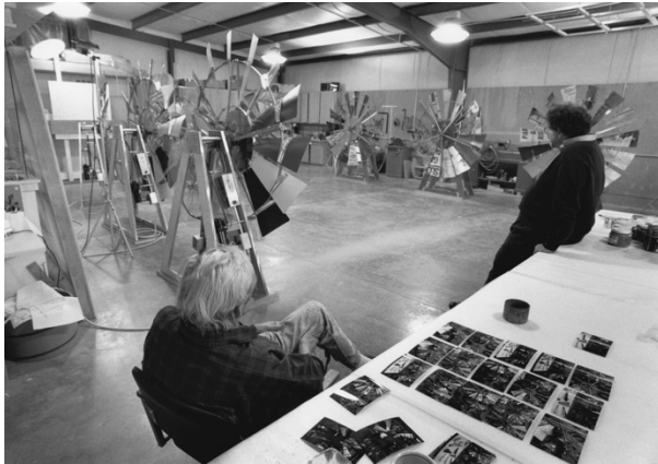
Rauschenberg and Donald Saff discussing the Eco-Echo project, Oxford, Maryland, 1993.