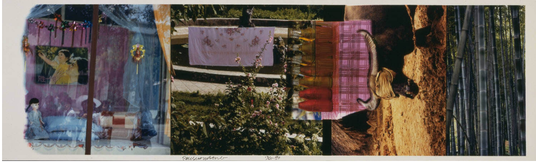
Robert Rauschenberg Studies for Chinese Summerhall #V , 1984 Chromogenic print 30 x 99 3/4 inches (76.2 x 253.4 cm) From an edition of 25, published by Graphicstudio, University of South Florida, Tampa