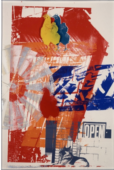
Robert Rauschenberg Cock-Sure , 1993 Acrylic screenprint, fire wax and silver pigment dust on paper with acrylic screenprint on Lexan in aluminum frame 63 1/2 x 44 inches (161.3 x 111.8 cm) From an edition of 17 published by Saff Tech Arts, Oxford, Maryland

Holzer: They get recycled, sure. You see stuff go through his work. And there again the windmill is put into there with these chickens and layered images, and a dog in there and stuff like that.