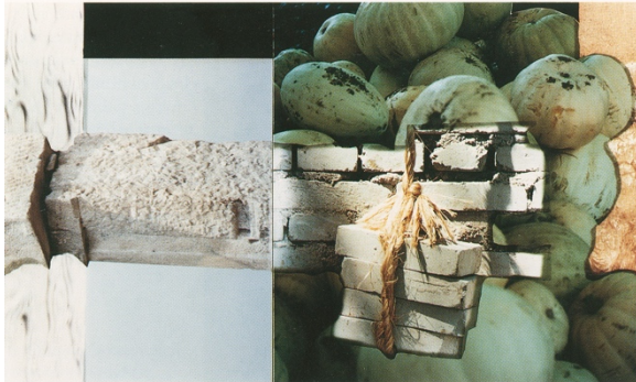
Robert Rauschenberg Chinese Summerhall , 1982 (detail) Chromogenic print

Q: We're trying to bring up photos of various segments of Summerhall .