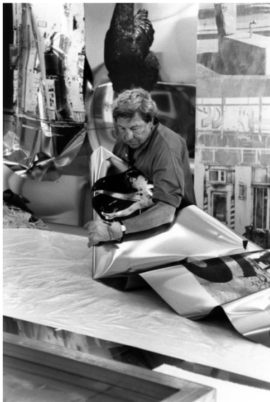
Rauschenberg working on Wax Fire Works series in his studio, Captiva, Florida, 1990. Work in background is Washington's Golden Egg / ROCI USA (Wax Fire Works) (1990).

That's working on ROCI too, yes. Because I did have some pictures that were around in here where he was working on, like when we first showed him the idea and we brought down some metal—that might be from that actually—just some flat sheets of thin stainless steel metal and said, "Don't cut yourself up dude, but crumple this thing and feel it." And he had a good time with it. He said, "Yes, I like this idea." Actually he's making—that's for ROCI. That's for a different piece—I don't know that I have it here. But yes, that was a fun thing to work with.