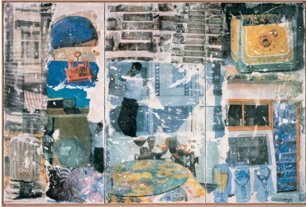
Robert Rauschenberg On Hold (Arcadian Retreat) , 1996 Fresco in artist's frame 74 1/2 x 111 1/2 inches (189.2 x 283.2 cm) The Broad Art Foundation, Santa Monica, California