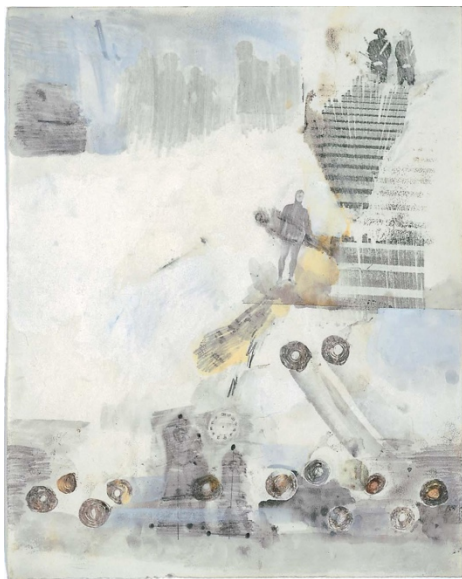
Robert Rauschenberg Canto XXIII: Circle Eight, Bolgia 6, the Hypocrites, from the Series Thirty-Four Illustrations for Dante's Inferno, 1959-60 Solvent transfer on paper with pencil, gouache, watercolor, and wash 14 3/8 x 11 1/2 inches (36.5 x 29.2 cm) The Museum of Modern Art, New York Given anonymously

Ashton: Yes, he had a parakeet, at least when I knew him. What can I tell you? Then and still, once I'm interested in an artist's work I follow where they go. I follow them. I don't stand back and say, "Oh, you shouldn't go that way," never. I go where they go and try to understand why they went there and that was true with Bob too. Bob Rauschenberg and I, we got along very well, and then I got involved with him, through [Leo] Castelli, in the Dante drawings project. [Note: Having written some of the earliest considerations of the original Thirty-Four Illustrations for Dante's Inferno (1958–60), she was later commissioned to write the accompanying text, a canto by canto discussion, for the facsimile portfolio Rauschenberg: XXXIV Drawings for Dante's Inferno (1964).] I saw a lot of Bob when we were working on that.