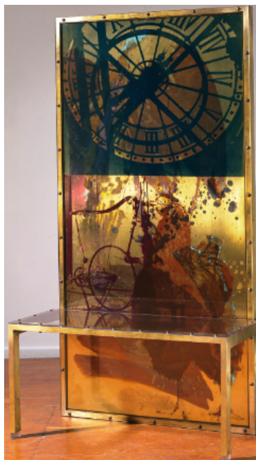
Borealis Shares I, 1990