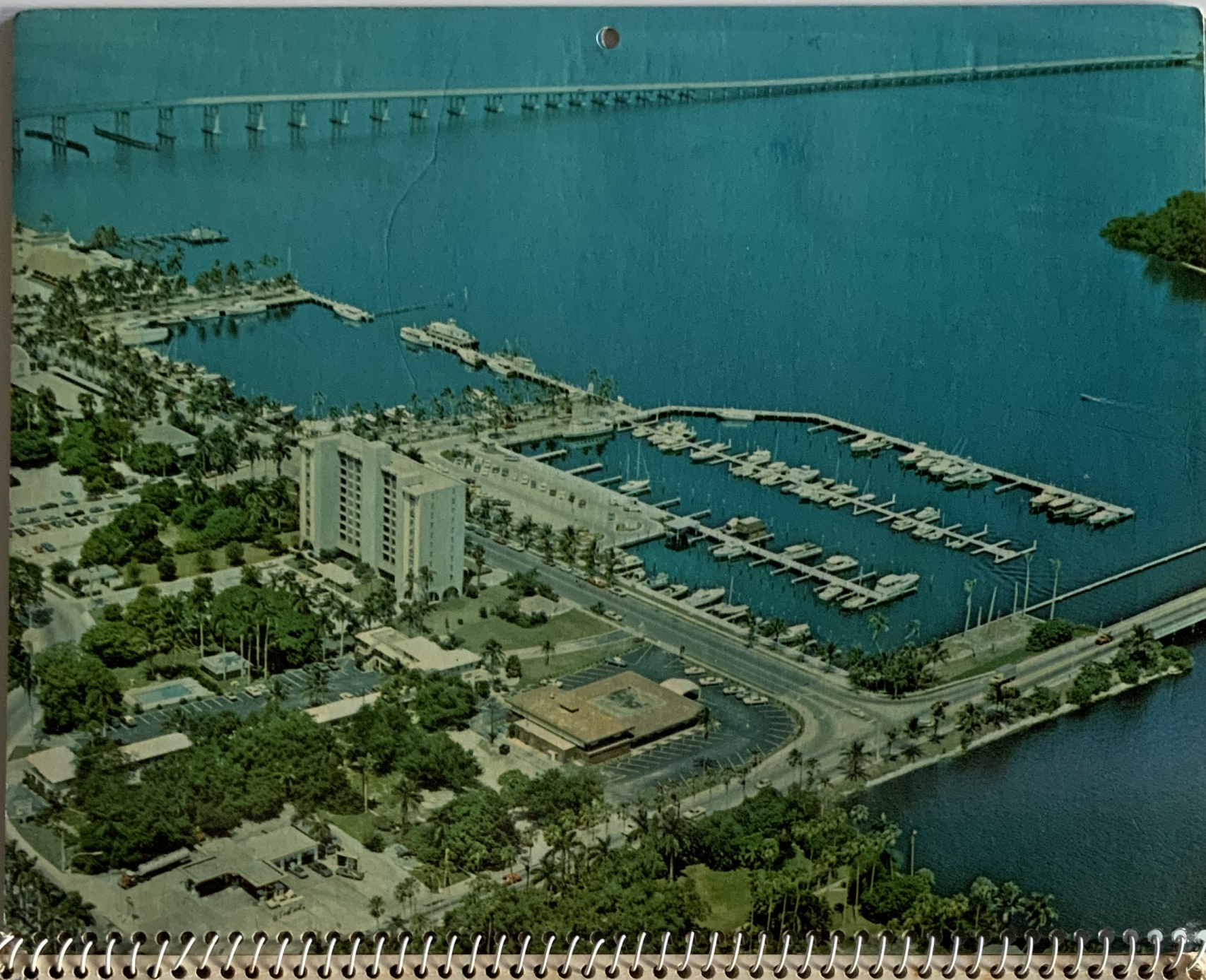
An aerial view of the yacht Basin and Twin Bridges over the Caloosahatchee River