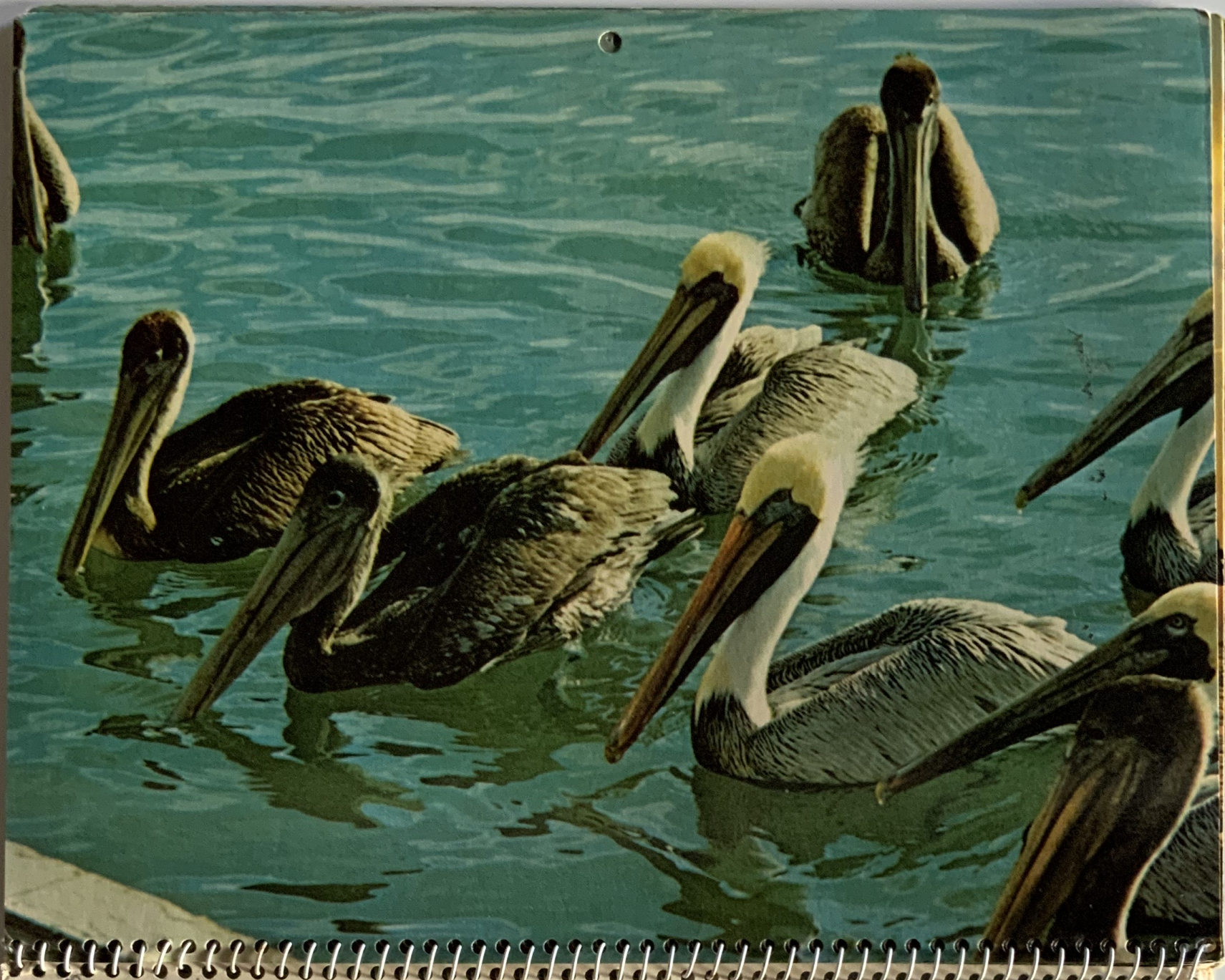
Pelicans waiting for a handout