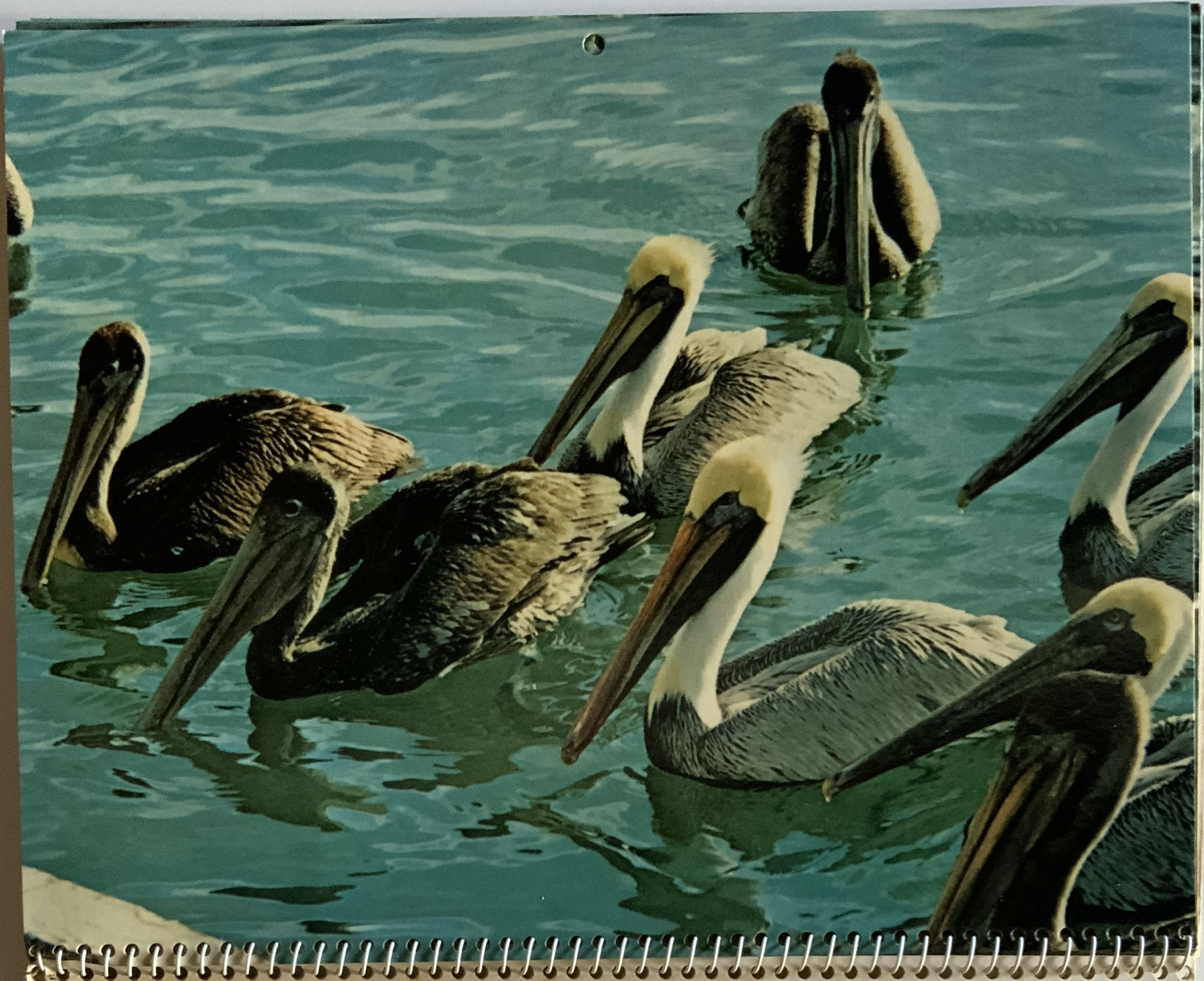
Pelicans waiting for a handout

FMY → NY → DC → NY → SA → TOKO → OSAKA → SRI LANKA → NY → FMY FMY → NY → PARIS → MOSCOW → NY → FMY