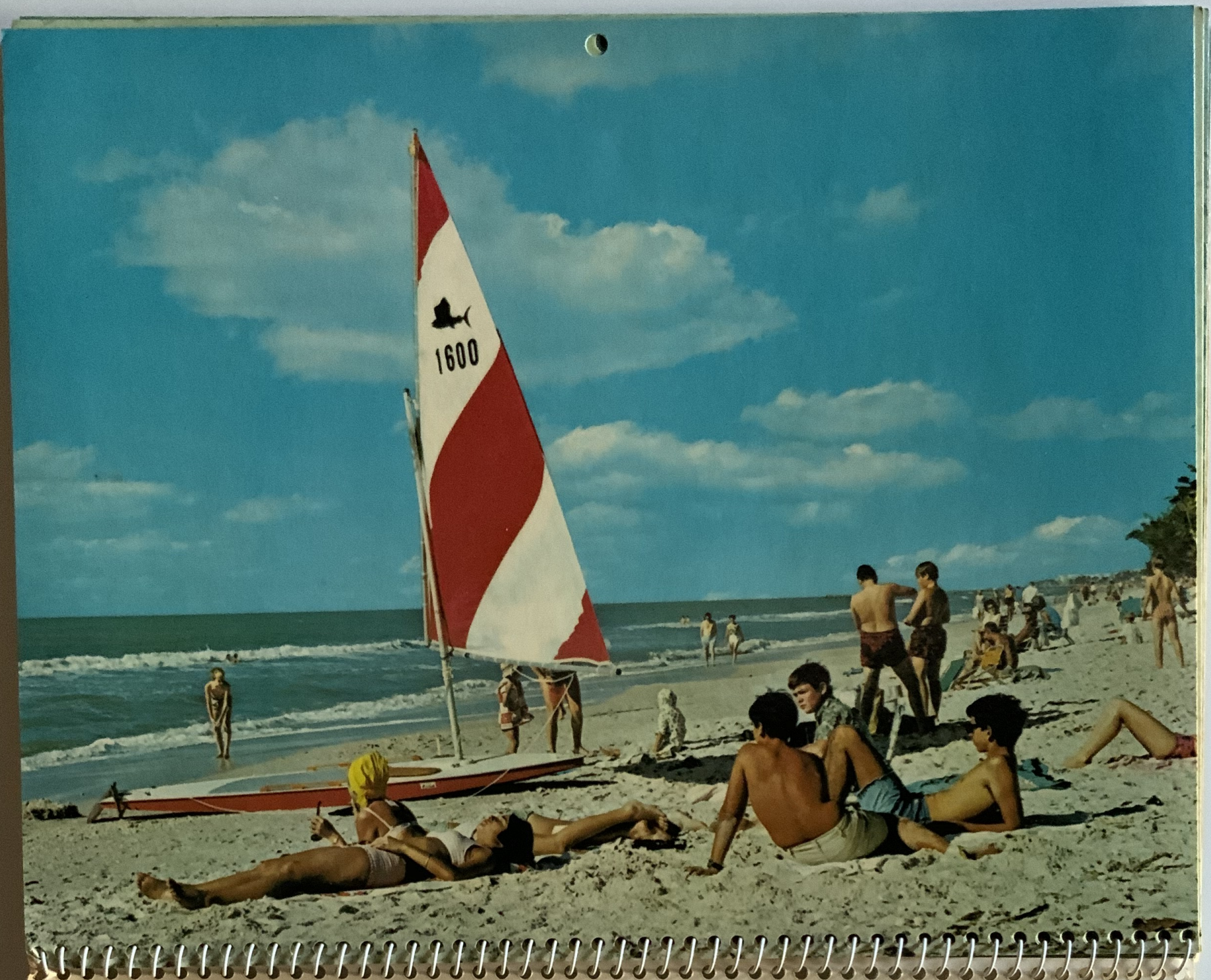
Relax on Gulf Beaches