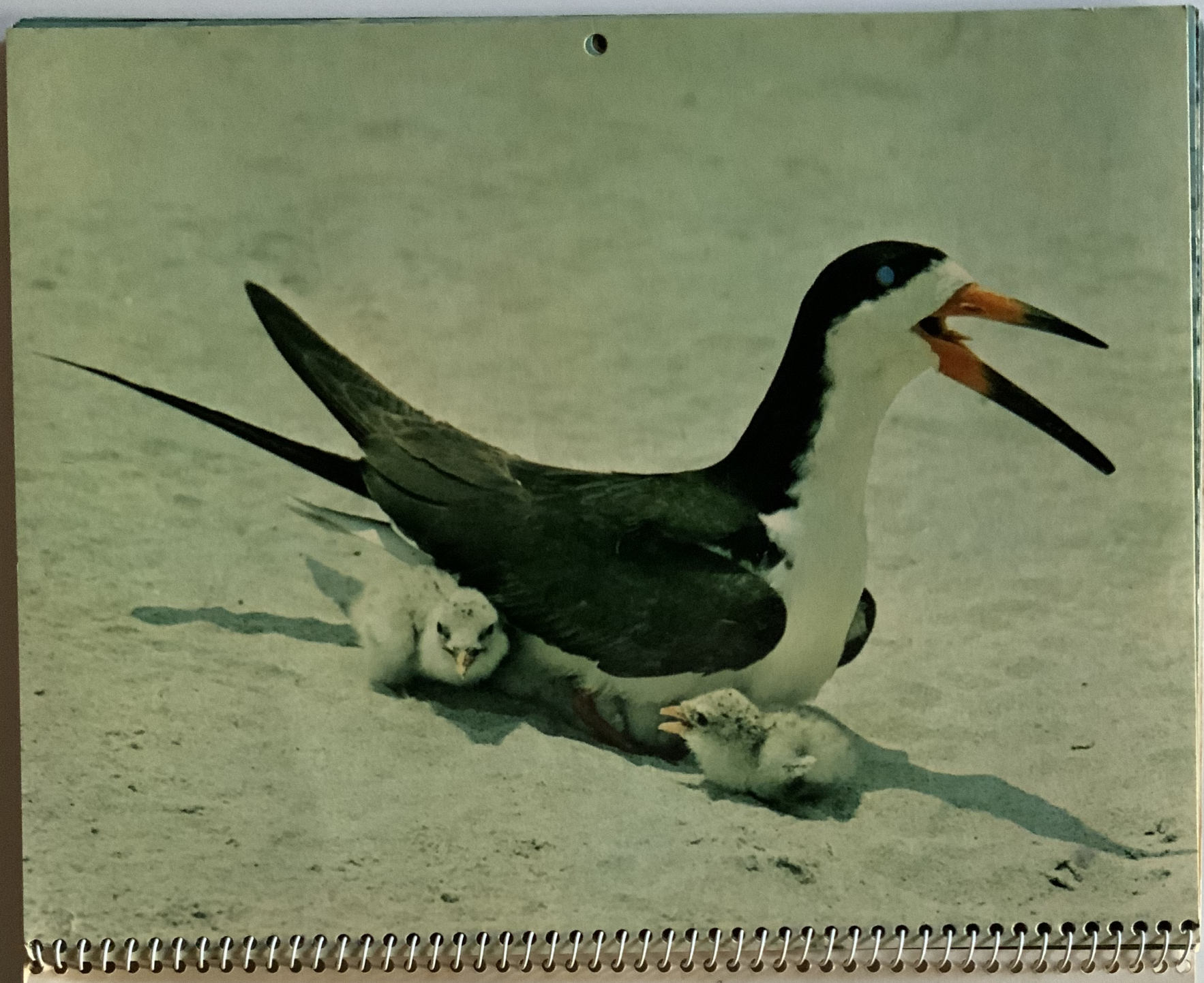
Black Skimmer and Babies