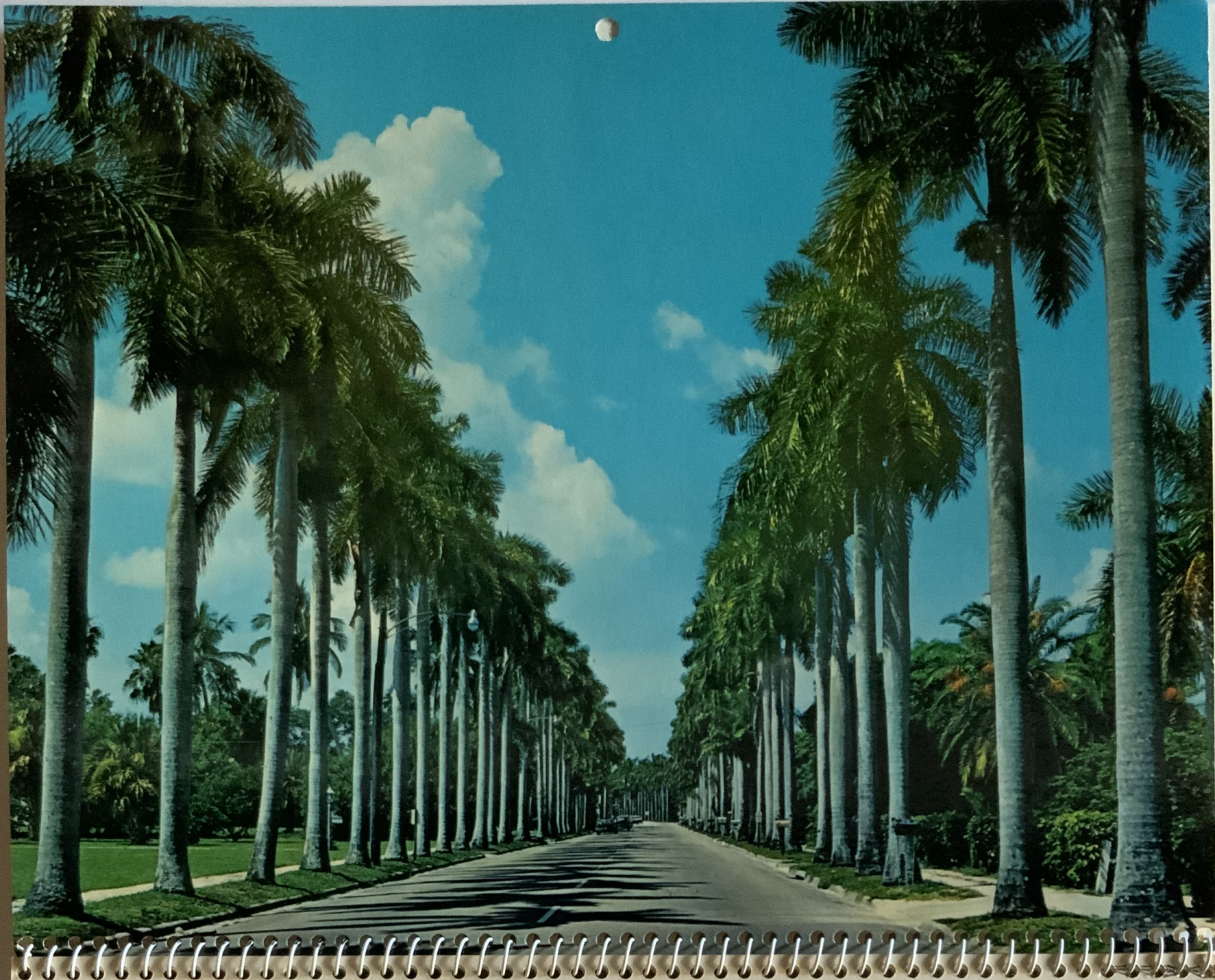
Palm Lined McGregor Blvd.