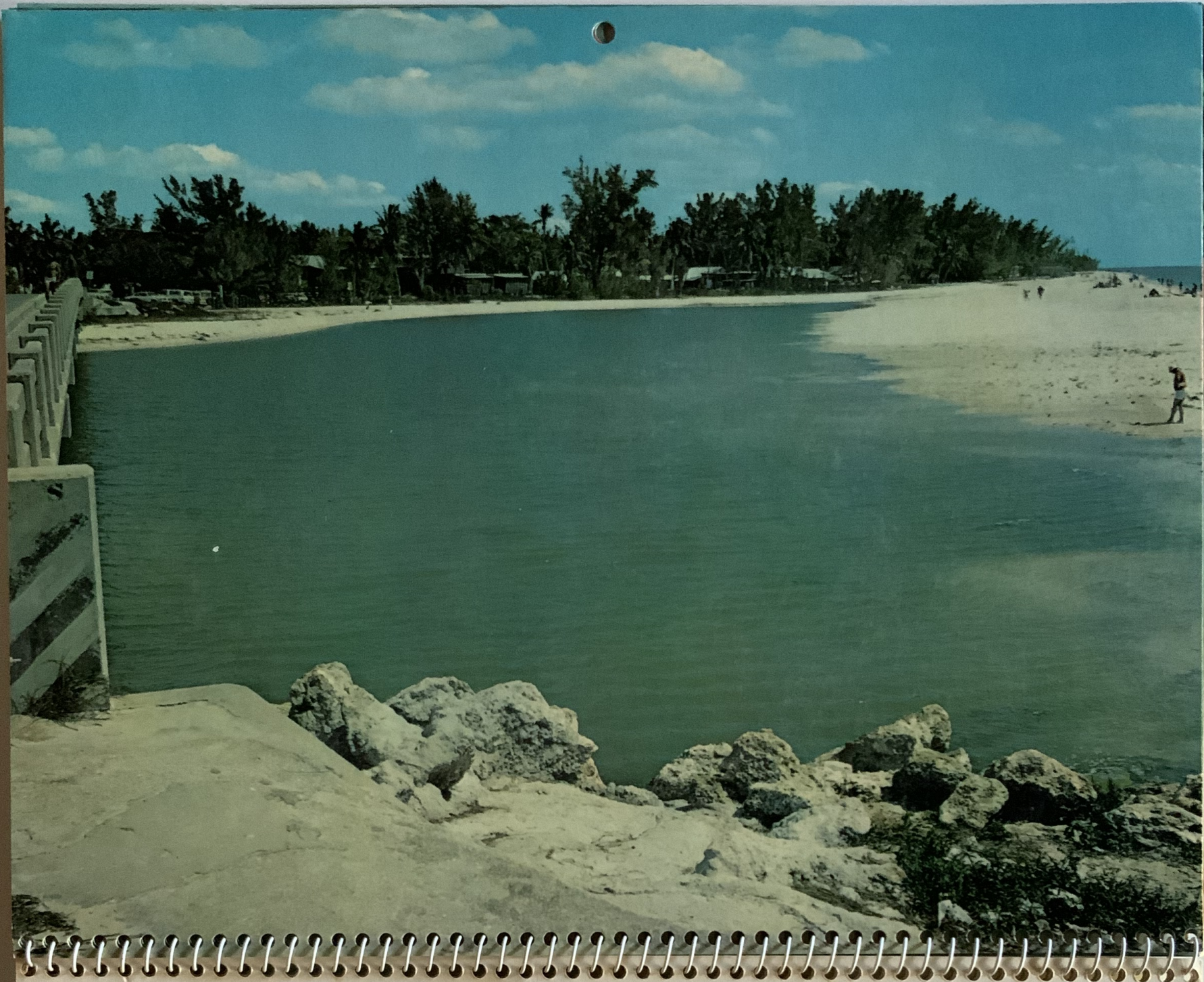
The pass between Sanibel and Captiva Islands