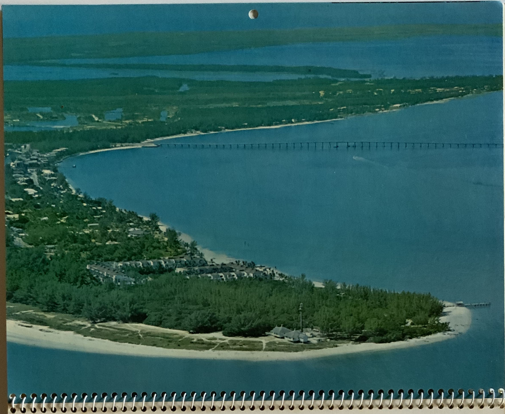
Beautiful Sanibel Island, Florida