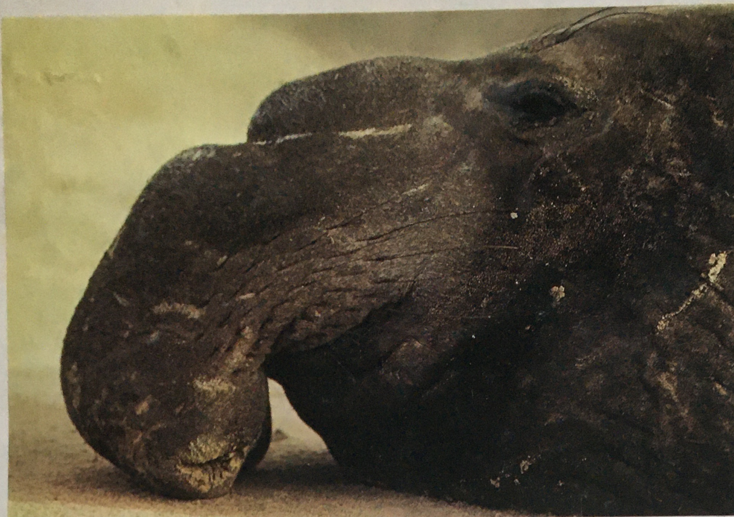
Northern elephant seal ( Mirounga angustirostris), Ano Nuevo State Reserve, California.