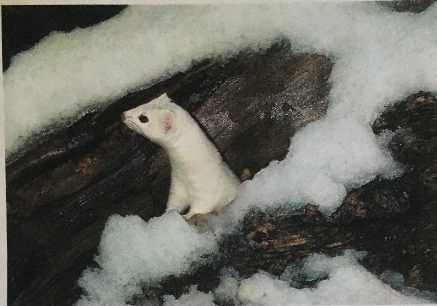
Long-tailed weasel ( Mustela frenata) in winter pelage. Adirondack Mountains, New York.