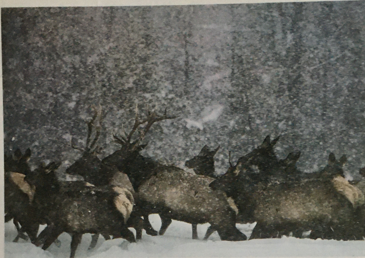
EIK ( Cervus canadensis), Jackson Hole, Wyoming.