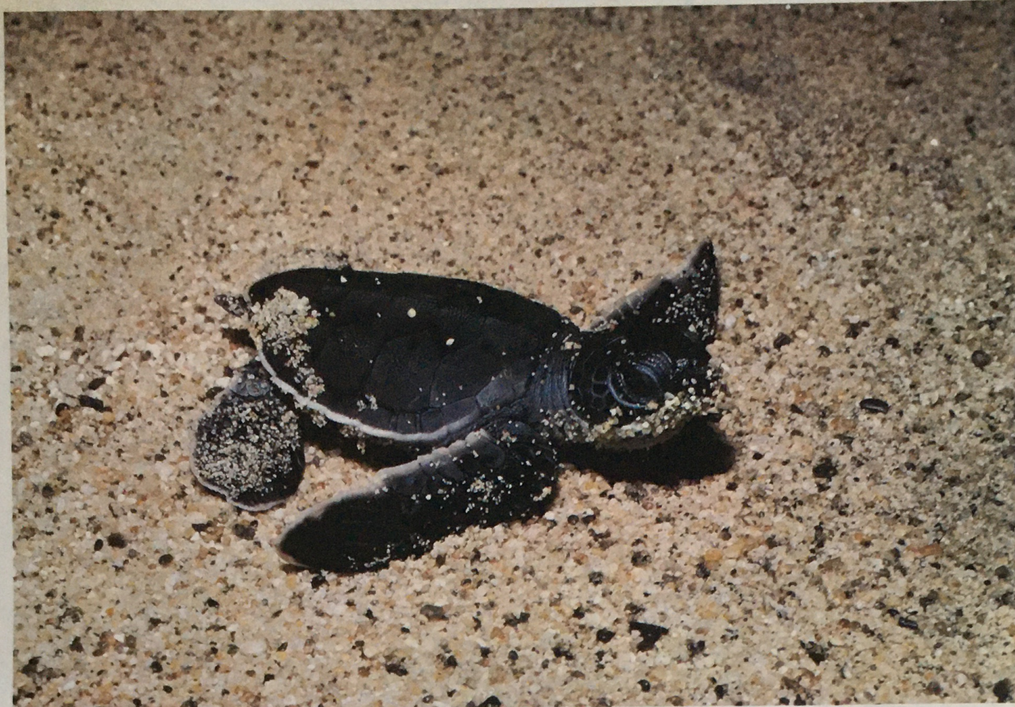
Baby green sea turtle ( Chelonia mydas) heading for the Pacific, Maruata, Michoacan, Mexico.