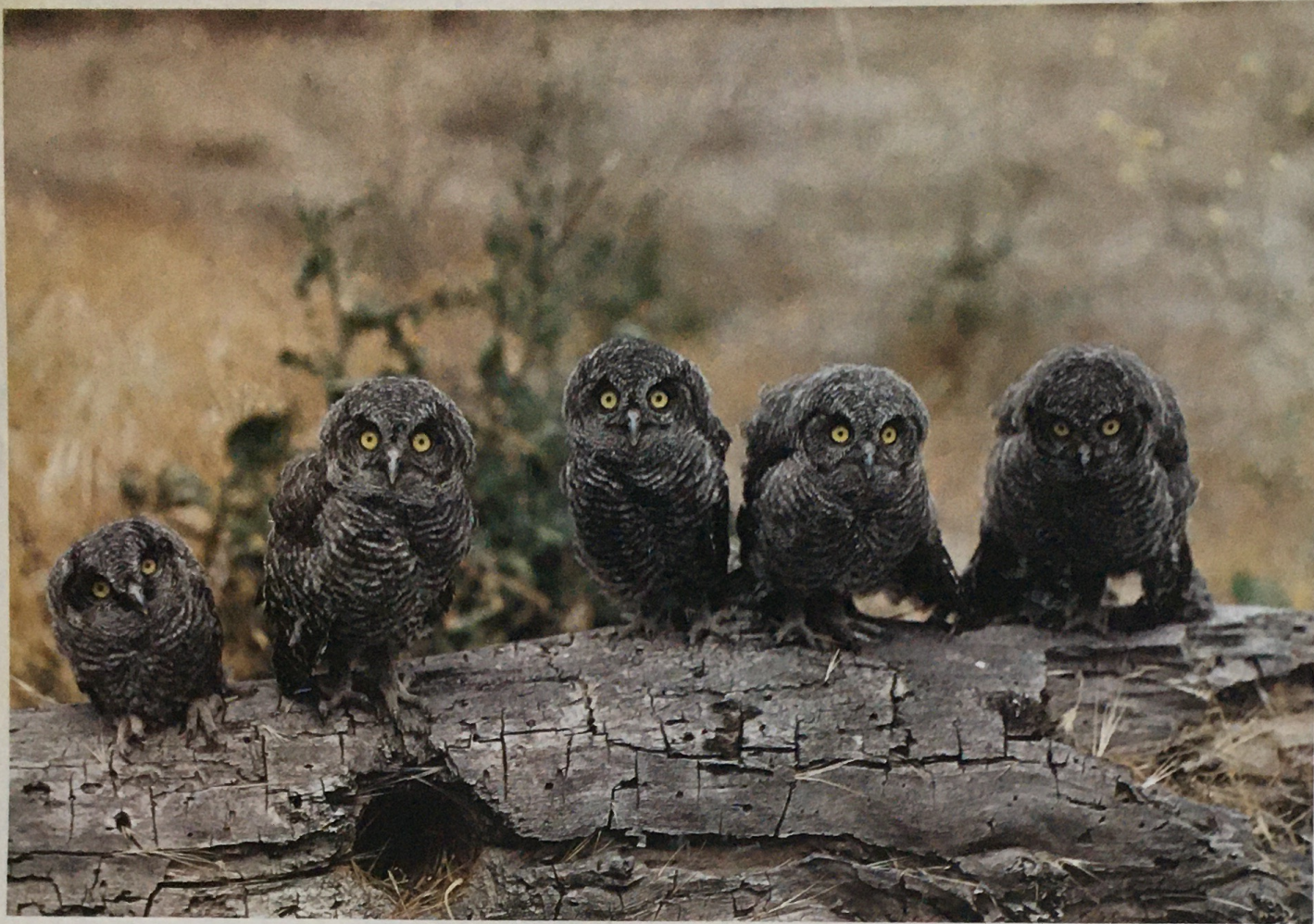
Screech owls ( Otus asio), Romoland, California.