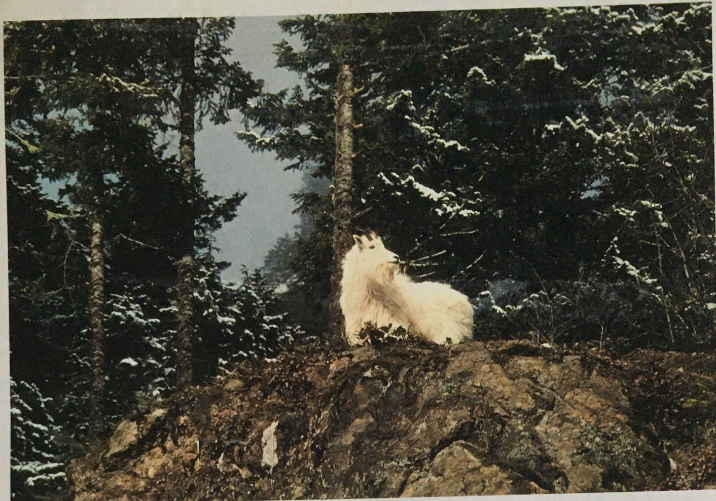
Mountain goat ( Oreamnos americanus ) in Olympic National Park, Washington. By Beth Eldridge.

04 Calendar said opening in London April 28 th