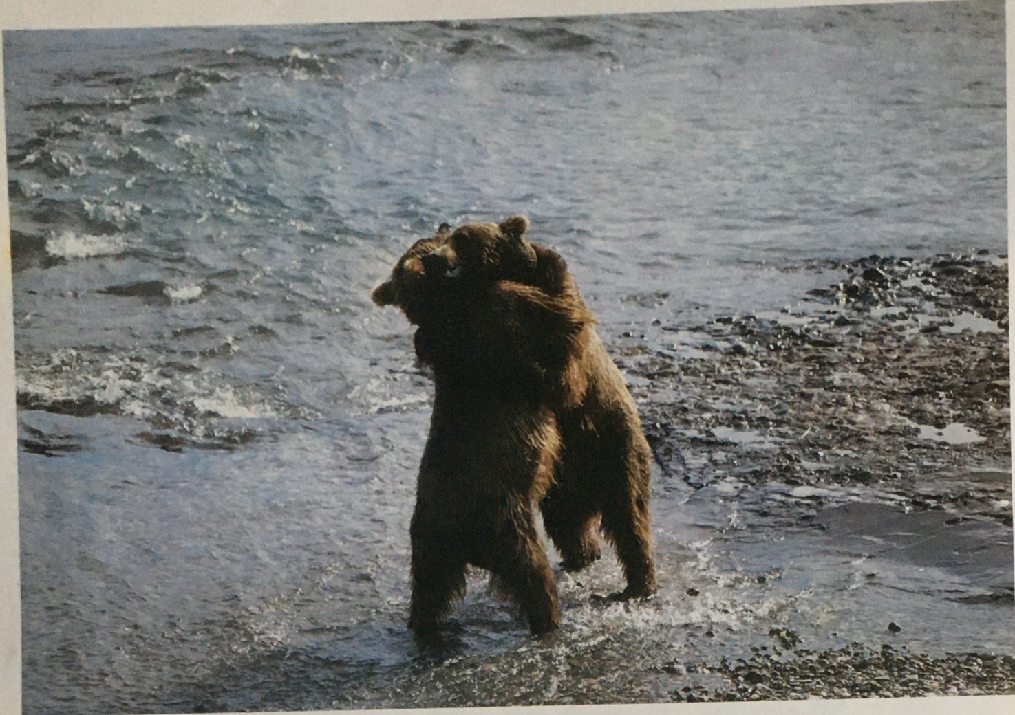
Brown bears ( Ursus arctos), McNeil River, Alaska.