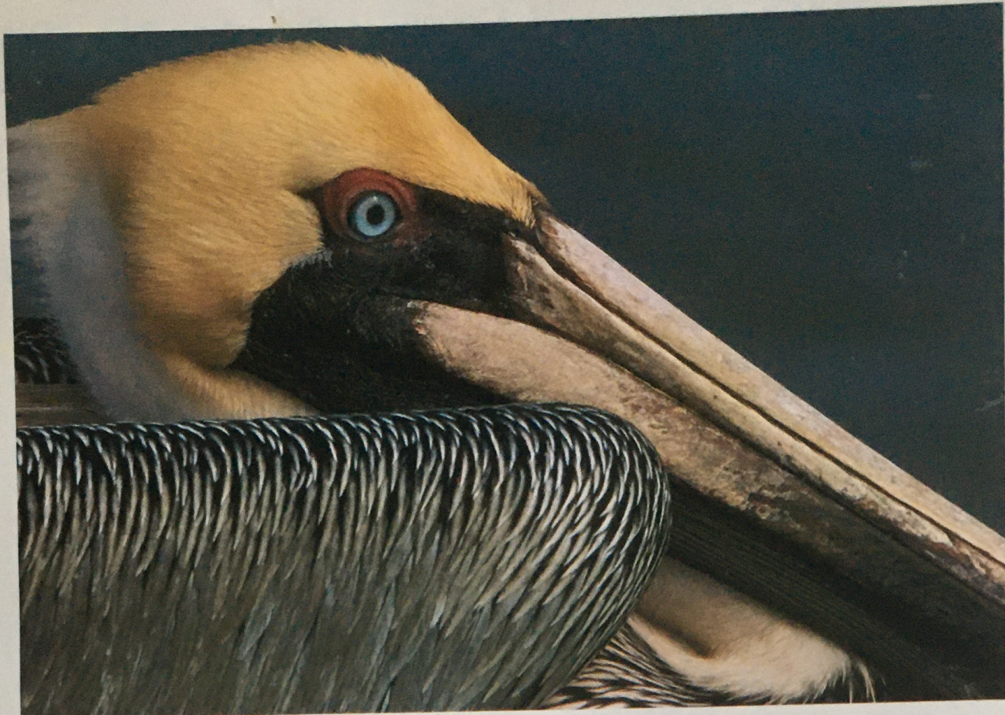
Eastern brown pelican ( Pelecanus occidentalis), Everglades National Park, Florida.