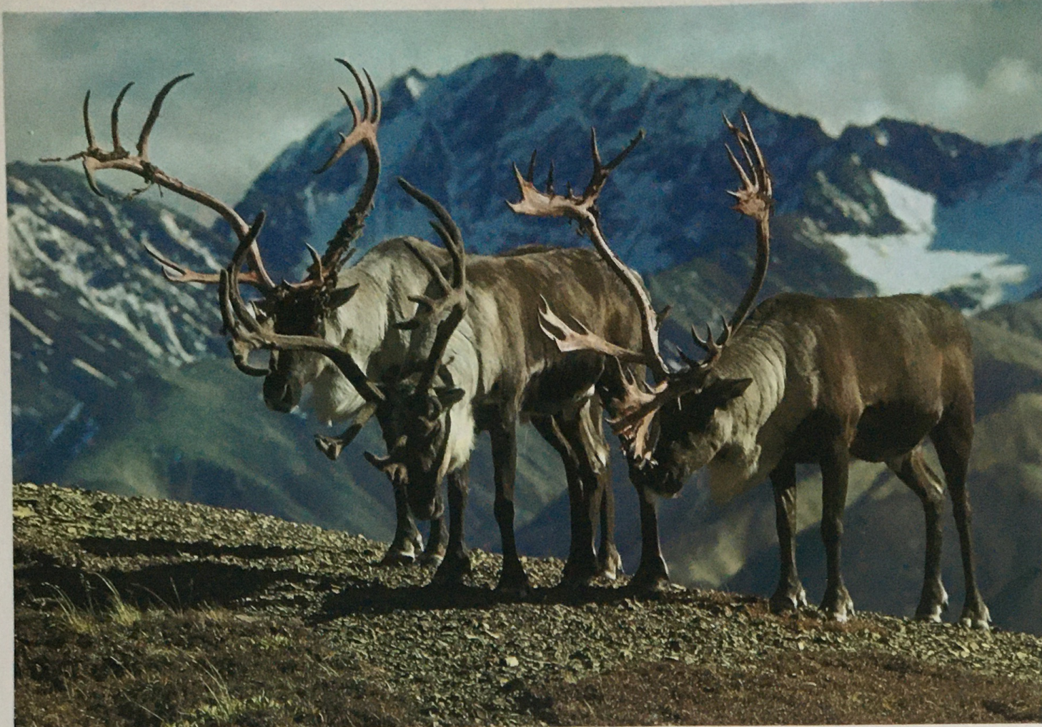
Caribou bulls ( Rangifer caribou ), Mount McKinley National Park, Alaska.