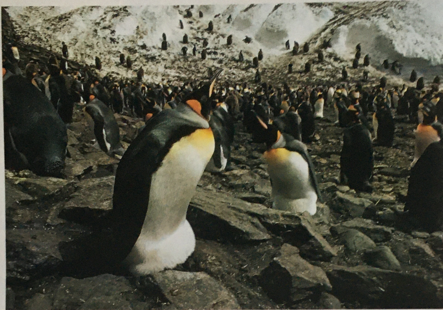
King penguins ( Aptenodytes patagonicus ). Antarctica.