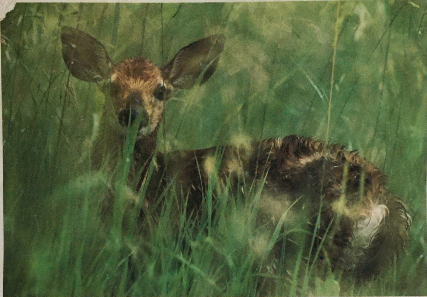
Whitetail fawn ( Odocoileus virginianus) near Stockbridge, Michigan.